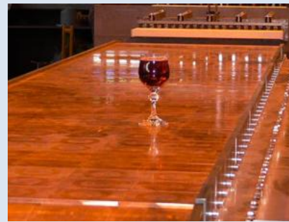
Excellent Surface Quality